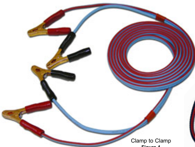
Clamp to Clamp Figure 1

*Reference Figures on this page and opposite.