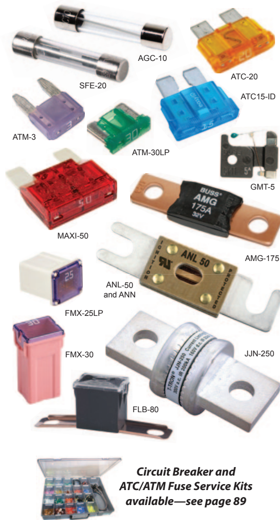
Circuit Breaker and ATC/ATM Fuse Service Kits available—see page 89

More fuse styles and sizes available online! Look for ABC, MDA, FRS-R, KLM, KTK and other Bussmann® fuses at store.polarwire.com