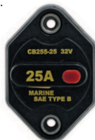
255 Series Mid-Range Part Number CB255-25

255 Series Switchable Manual Trip Push-Button Mid-Range Breakers are rated from 10 to 50 amps. Use in marine, agriculture, construction, RV, chassis and specialized equipment market applications.