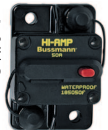
185 Series HI-Amp Panel Mount Part Number CB185P-50