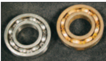
The bearing on the left was treated with CorrosionX; the one on the right was left untreated. Both were sprayed with seawater every day for two weeks. Note the remarkable difference.

CorrosionX® Heavy Duty forms a dripless, non-hardening, self-healing film that stubbornly resists removal by splash or spray—even full saltwater immersion. It penetrates rust and corrosion, removes moisture, stops electrolysis, then seals.