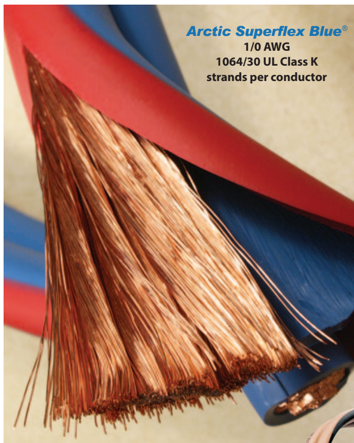
Arctic Superflex Blue® 1/0 AWG 1064/30 UL Class K strands per conductor

1/0 AWG 2/C ARCTIC SUPERFLEX BLUE -55C TO 105C VW-1 600 VOLTS OIL RESISTANT