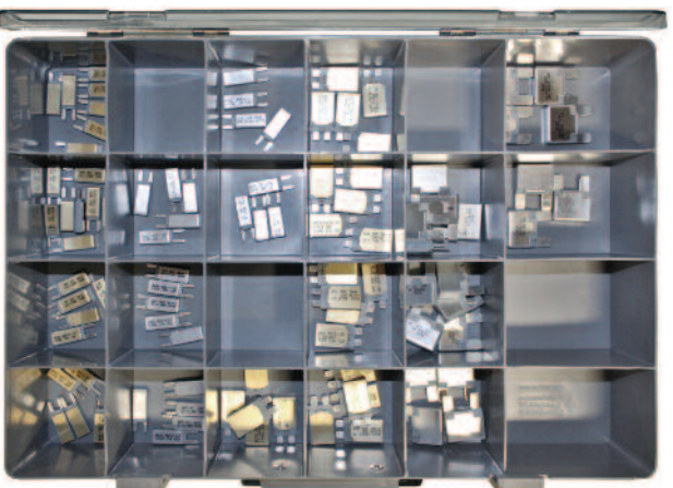
CIRCUIT BREAKERS KIT Part Number KIT-BREAKERS A wide selection of 12 volt circuit breakers in sizes ranging from 10 to 40 amps. 200 pieces. Two drawer satchels.