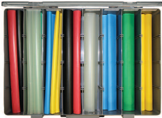
COLOR HEAT SHRINK KIT Part Number KIT-HS-COLOR Two-satchel kit stocked with adhesive-lined heat shrink tubing in 12" lengths and diameters of 1/8" to 1". Black, red, clear, white, green, yellow, and blue. 124 pieces. Two drawer satchels.